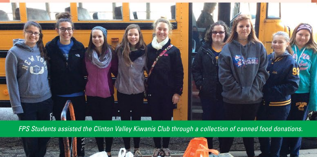
FPS Students assisted the Clinton Valley Kiwanis Club through a collection of canned food donations.